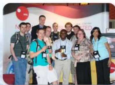
Some members of NAY-GN with NHL crew

announced that he's following up on an election promise to consider a second reactor at the Point Lepreau nuclear generating station on the Bay of Fundy in New Brunswick. He followed up by saying that a proposal for the study will be presented to his provincial cabinet within a few weeks.